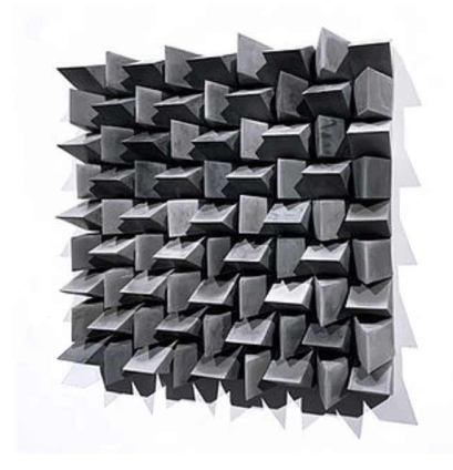
concrete sound cast concrete with pigment 33 x 33 x 6.5 inches 2020