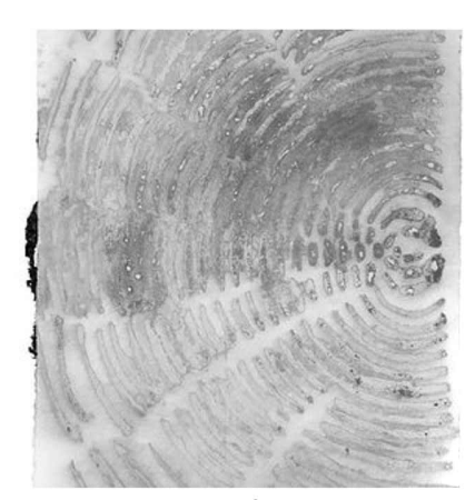
waveform handmade paper, cotton and linen with pigment 30x22 inches 2017