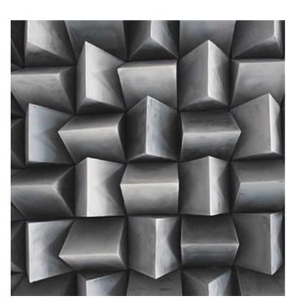
concrete sound cast concrete with pigment (detail) 2020