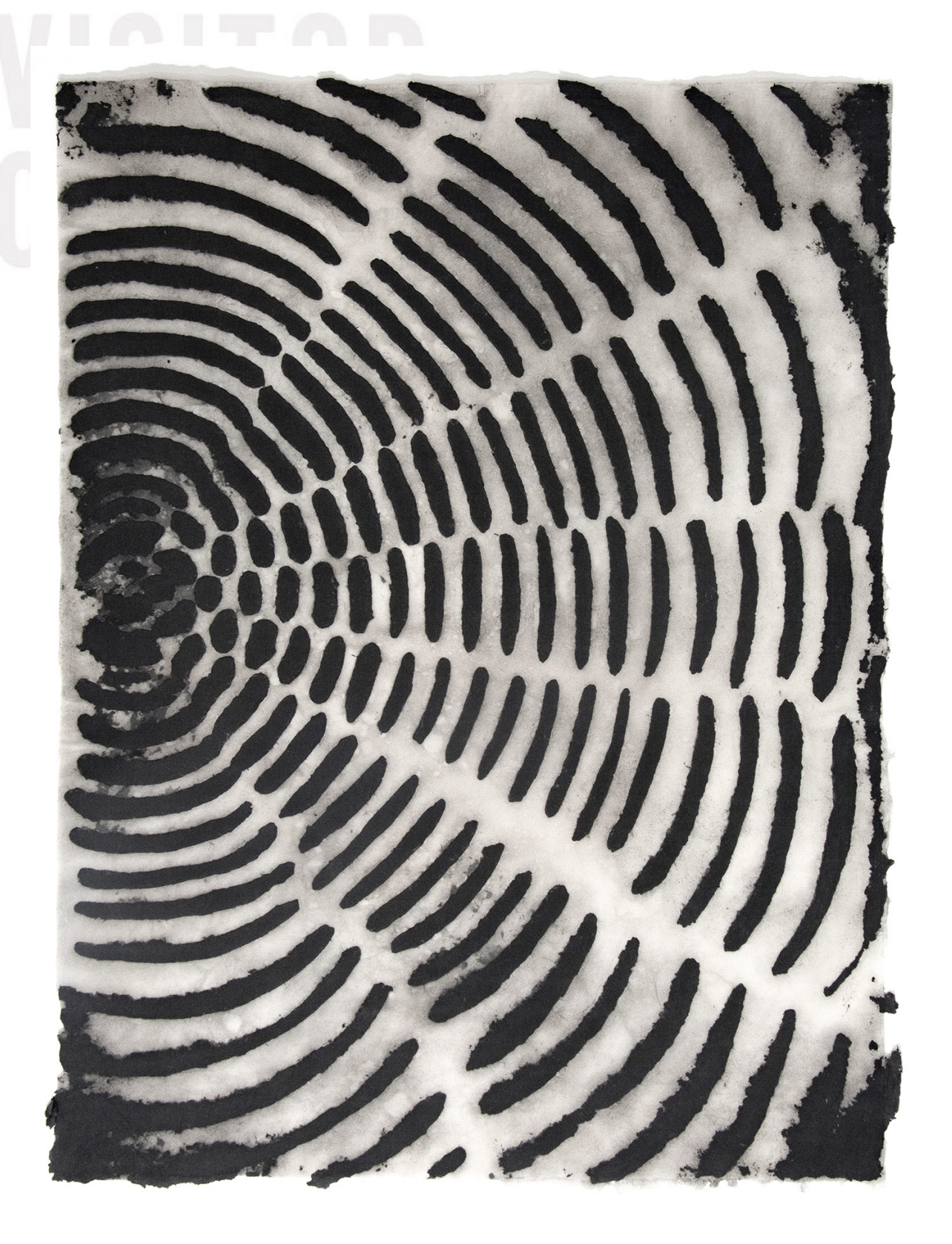
Audra Wolowiec, waveform , cotton and linen with pigment on linen and abaca, 40 X 30, 2017