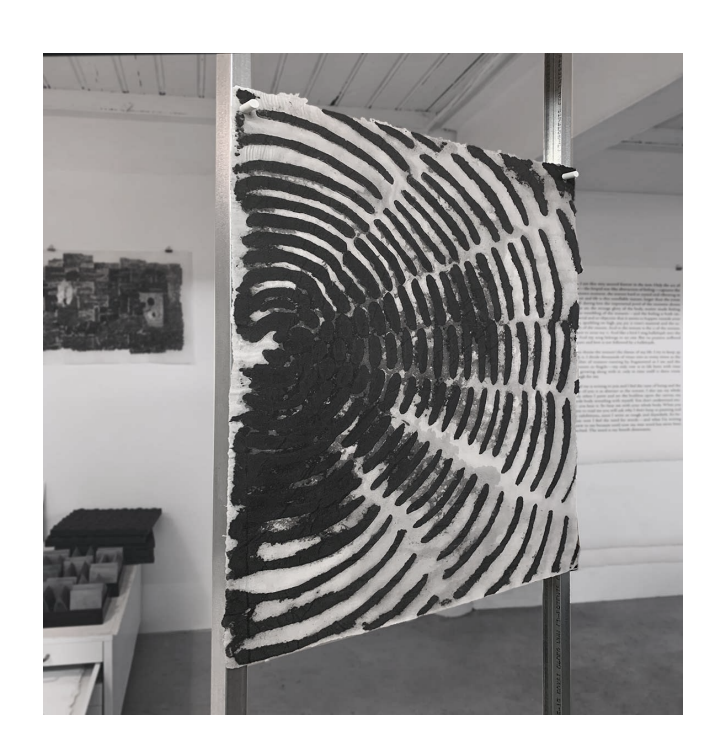
Audra Wolowiec in the process of creating 'waveform', at Dieu Donné, 2017